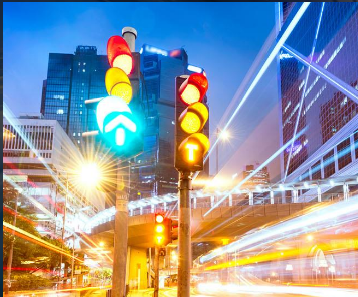
Automotive & Mobility Cooperative urban cross traffic