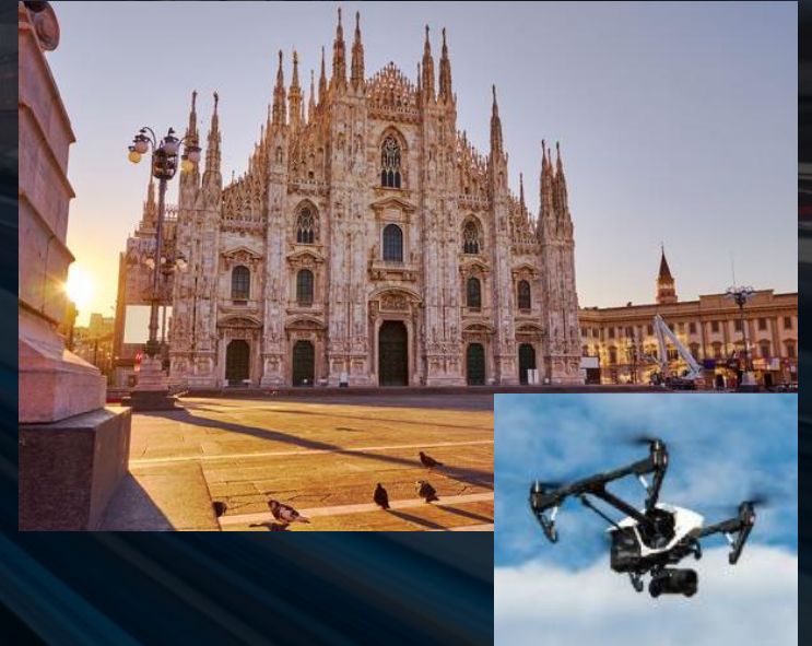
Safety & Surveillance Drones for aerial security