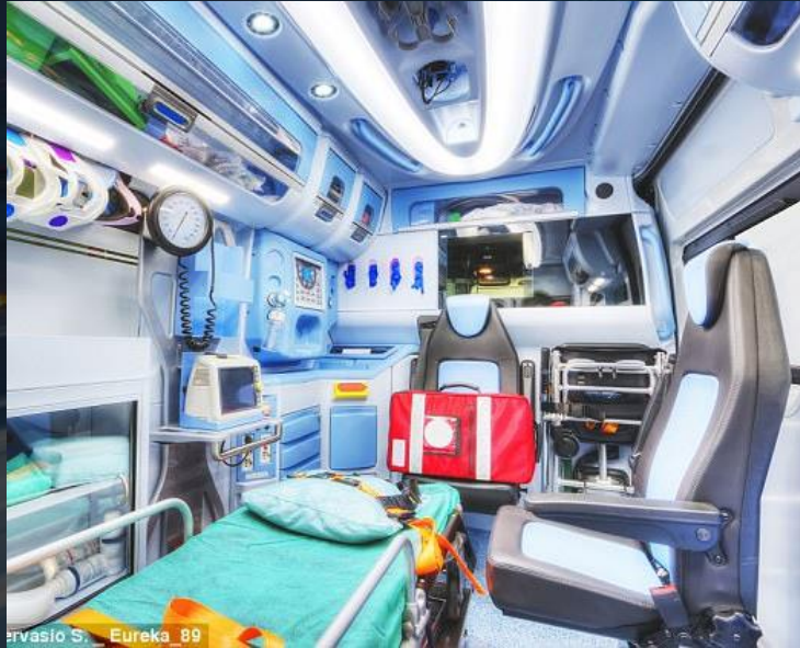
Health & Wellbeing Connected ambulance